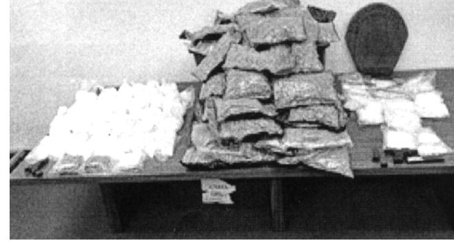
Drugs seized in raid

Police Department, San Joaquin County Probation Department, and the Tracy Police Department for their outstanding support in making this operation a success. This operation highlights the ongoing efforts to combat drug trafficking in our community.